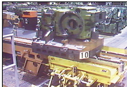
Figure 6: Precision interface automatically unloading and loading a pallet tool with engine at a CNC machine.

SI Lo-Tow towline systems can incorporate devices needed to interface with machine tools and automated or manual work stations.