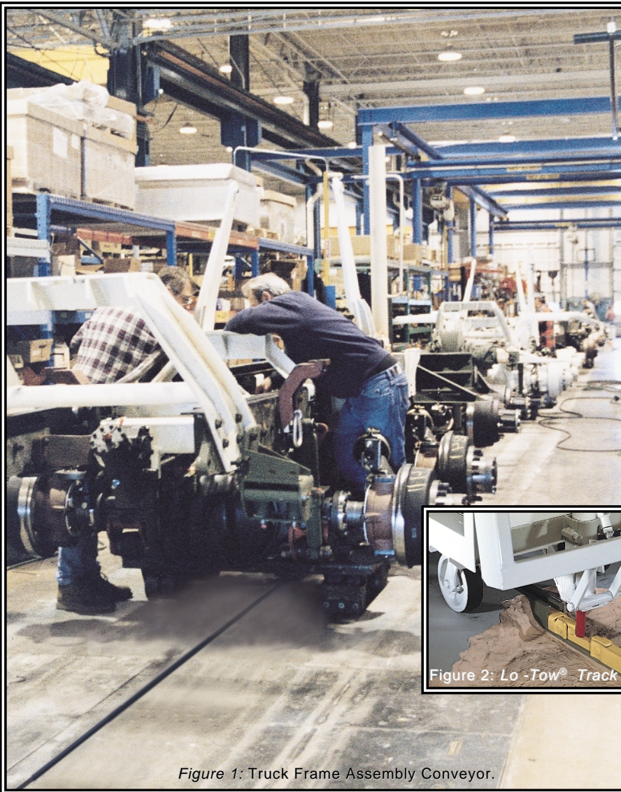
Figure 1: Truck Frame Assembly Conveyor.