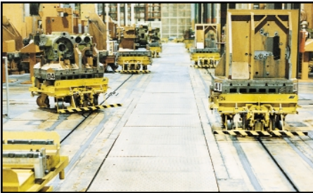
Figure 3: Computer-directed diesel engine / transmission casting and machining operation (8,000-lb. loads).

To meet the information management needs of today's material transport systems, SI has developed advanced towline control capabilities. State-of-the-art, PC hardware, coupled with easy to use menu-driven software, can incorporate real time cart management throughout the towline system. This can be used to manage the flow of work between work stations or to direct carts to areas for work piece delivery, pick-up or storage. When combined with bar code labeling of a work piece and RF cart ID tags, the SI Information Management Control System (SIIMS) can accomplish inventory management, WIP tracking, computer interfacing with other integrated material handling systems and provide complete system diagnostics.