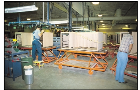
Figure 7: Ergonomically designed Towline carts function as a workbench at an off line assembly station.

Carts can be custom designed to meet special needs or functions. For example, carts can contain elevated decks which present product at ergonomically friendly heights which can be used as a workbench. Rotatable decks or built-in lift/lower tables can rotate or raise or lower