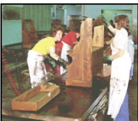
Figure 4: Lo-Tow system for furniture finishing and assembly.

SI Lo-Tow is used to interface with all types of manufacturing equipment, operations and work cells. Lo-Tow systems are used to solve difficult production logistic problems in a wide variety of manufacturing applications from light duty furniture manufacturing (200 lb. loads) up to heavy duty truck assembly (35,000 lbs.). Towline systems can be used to link an entire plant moving raw materials from receiving - to storage - to process assembly areas — to finished storage or shipping.