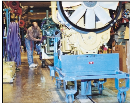
Figure 5: Lo-Tow indexing system for diesel engine final assembly.

accomplished on continuous moving - slow speed systems where the conveyor can move slower than 1" per minute ( as illustrated by figure 1, front side) have a variable speed capability or have an indexing speed between stations of up to 90 FPM.